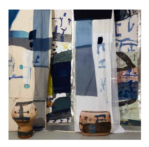
Document Set ID: 5973590 Version: 1, Version Date: 30/10/2020

This annual exhibition is an excellent survey of the region's thriving artistic community and includes works created by Mosman residents as well as Friends and volunteers of Mosman Art Gallery. The resulting large group exhibition shows contemporary artworks across the mediums of painting, drawing, printmaking, textiles, photography, sculpture and ceramics.